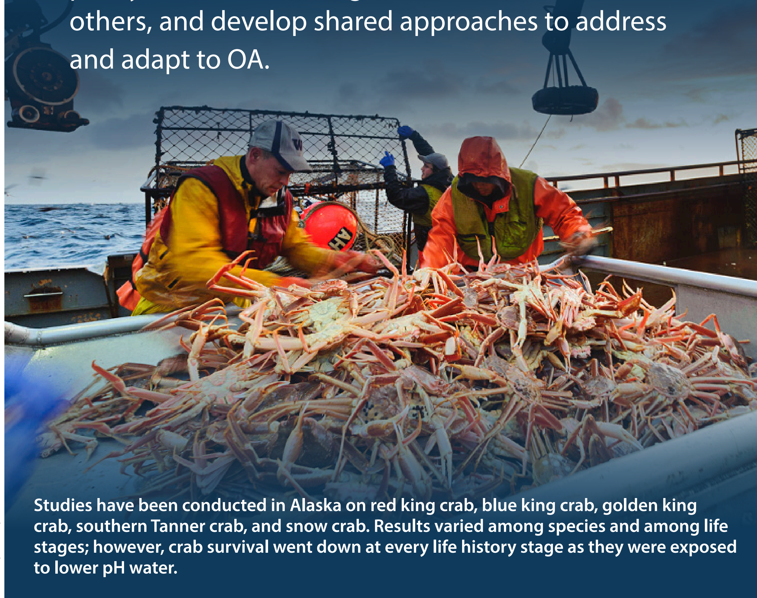
Studies have been conducted in Alaska on red king crab, blue king crab, golden king crab, southern Tanner crab, and snow crab. Results varied among species and among life stages; however, crab survival went down at every life history stage as they were exposed to lower pH water.