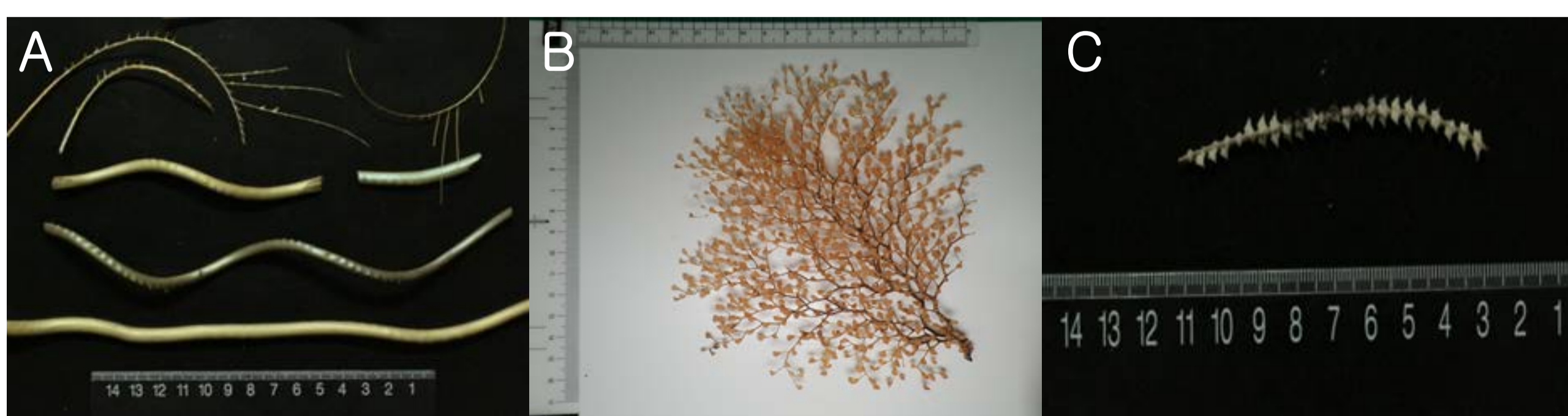
Figure 3. The samples using Epibenthic sledge(EBS). A: Iridogoria splendens , B: Chrysogoria chryseis , C: Calyptrophora wyvillei

NCBI Nucleotide, Pfam, Gene ontology (GO), EggNOG, and UniProt were used to search for Unigene's functions. Iridogoria splendens 26.9% of the total assembly results were function-checked, and 52,176 of the total 193,579 unigenes were found in at least one database. Chrysogoria chryseis 31.7% of the total assembly results were function-checked and 74,772 of the total 235,513 unigenes were found in at least one database. Calyptrophora wyvillei 26.4% of the total assembly results were function-checked, and 51,334 out of a total of 193,796 unigenes were found in at least one database.