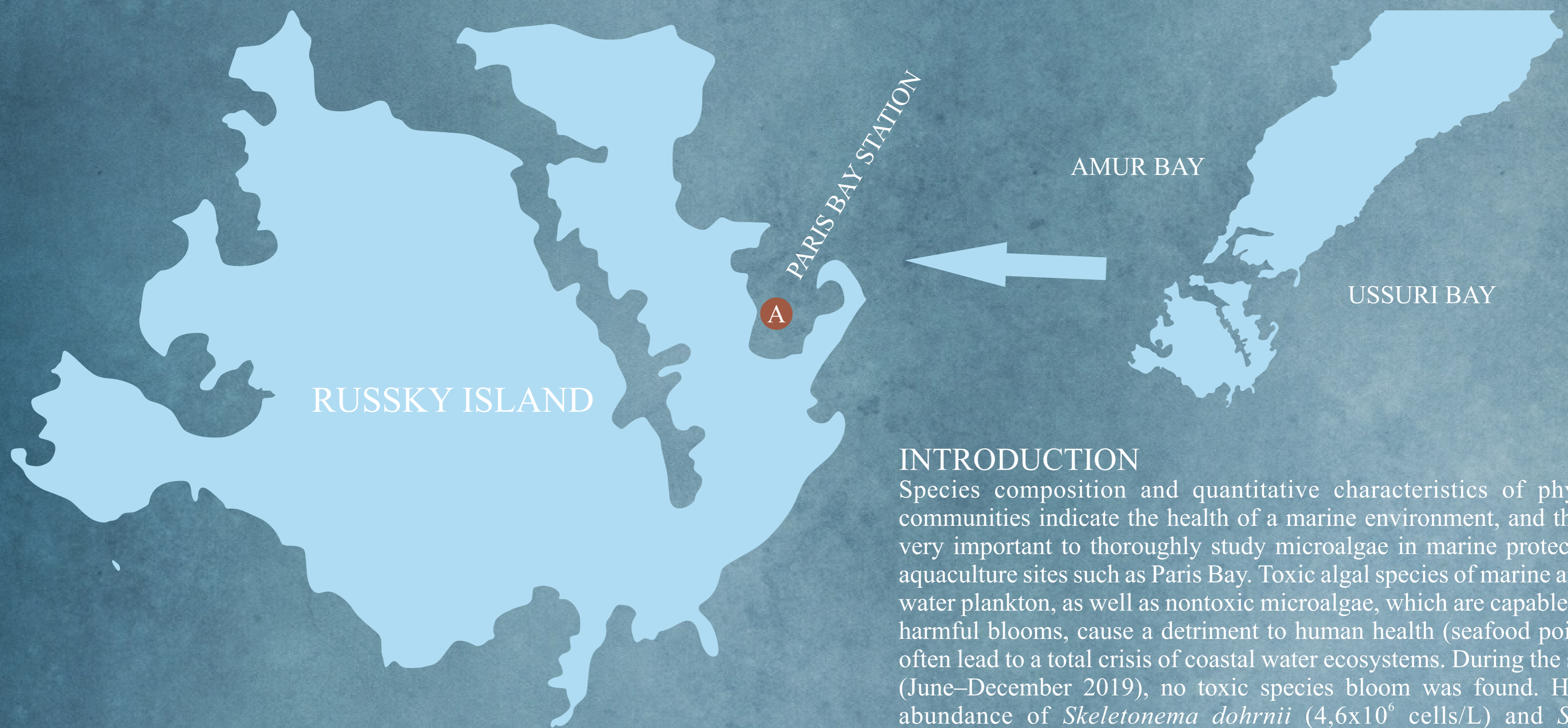
Scheme of the monitoring site location (A) in the Paris Bay

1 A.V. Zhirmunsky National Scientific Center of Marine Biology, Far Eastern Branch, Russian 2 Far Eastern Federal University, Vladivostok, Russia