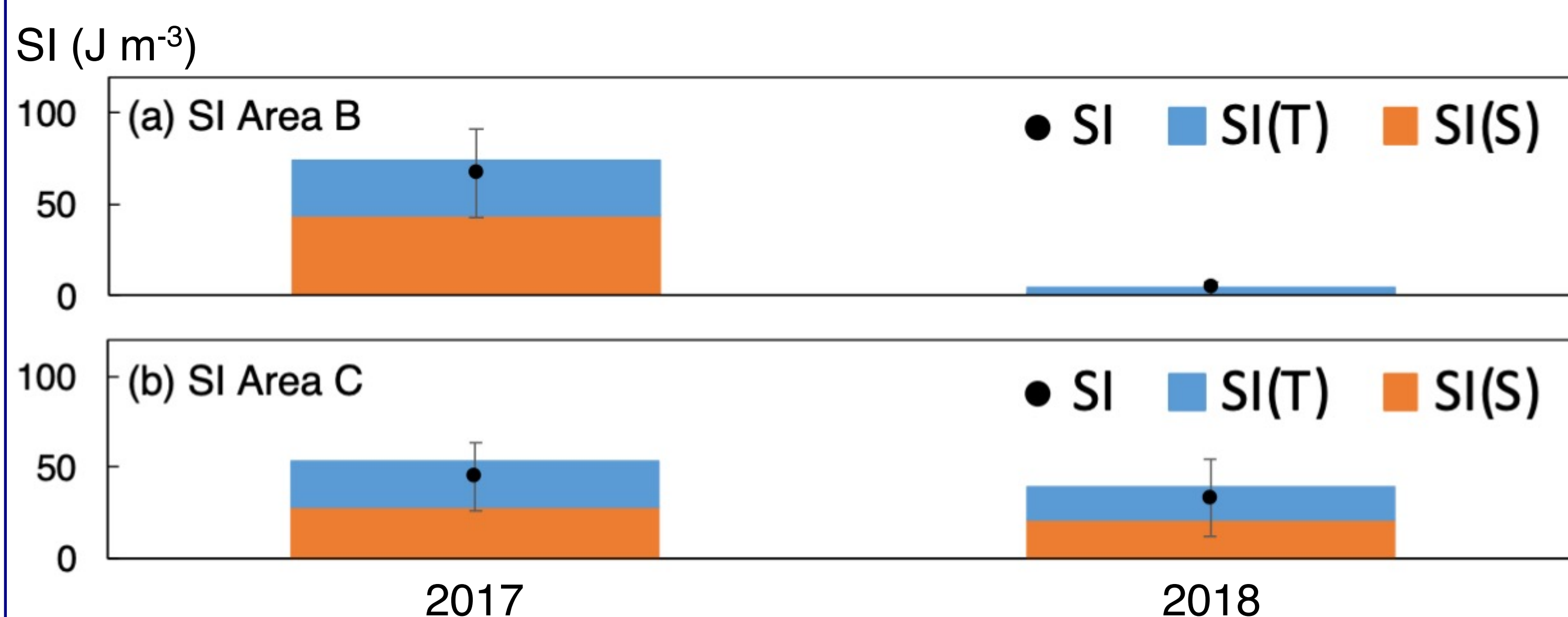
Fig. 2 SI averaged in Area B & C in early summer 2017 & 2018