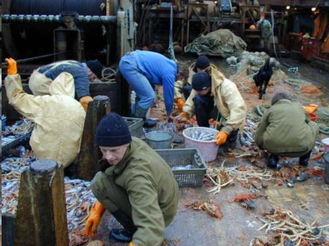
The results of the work of a huge number of researchers