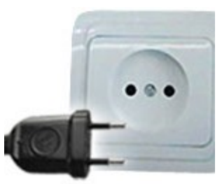
Type C: This socket also works with plug E and F

In South Korea the power sockets used are of type C and F. Check out the following pictures.