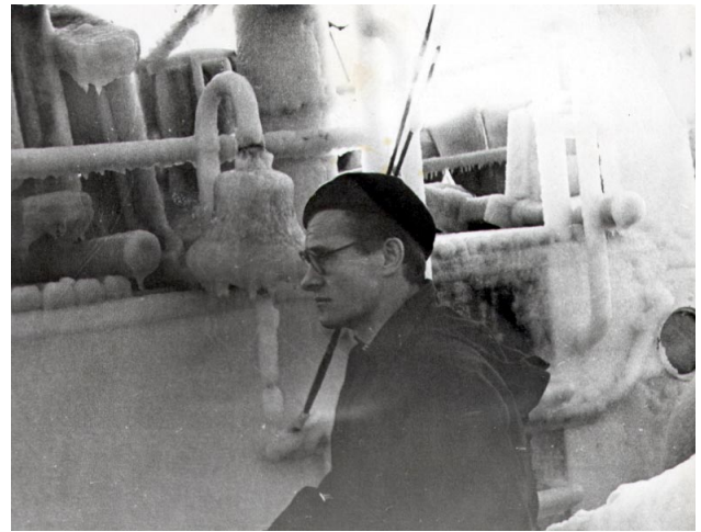
As a youth in northern and southern latitudes, aboard the trawler “Zhemchug” in Bristol Bay in 1960 (left) and aboard the R/V “Akademik Berg” near New Zealand in 1965 (right).