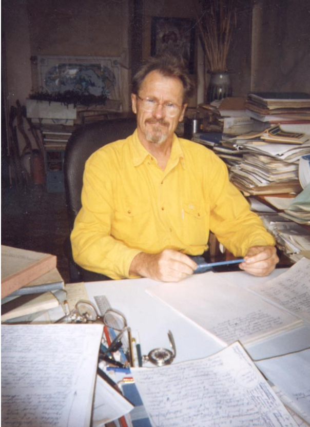
In his TINRO office, Vladivostok, September 1998.