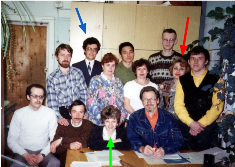
With colleagues from the Laboratory of Applied Biocenology at the Pacific Research Institute of Fisheries and Oceanography (TINRO), Vladivostok, May 1995.