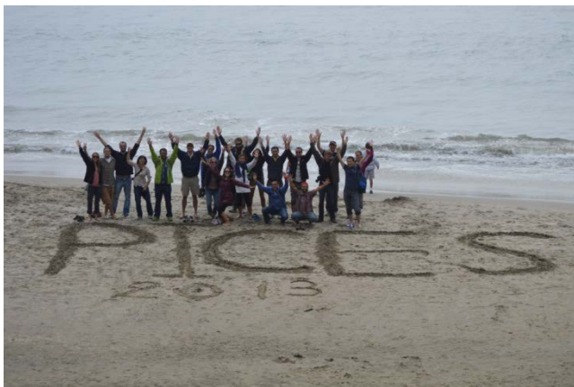
Photo 7 A way to say "Thank you for the wonderful experience" from our next generation of oceanographers.

The Summer School participants enjoyed meeting and collaborating with other young scientists from around the world. The working groups of about eight enabled close relationships to develop among participants. Discussion and camaraderie continued beyond the classroom and laboratory, with several evenings filled by informal gatherings and friendship. As one student put it, "the opportunity to interact with international students has been not only an excellent occasion to exchange views on each other's work, but also a perfect time to create new relations for future collaborations."