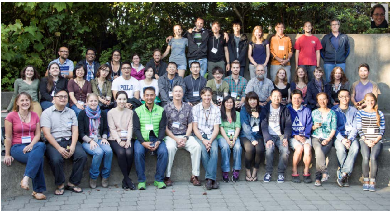
Photo 1 Participants in the PICES 2013 Summer School on “Ocean Observing Systems and Ecosystem Monitoring” (August 19–23, 2013, Newport, Oregon.