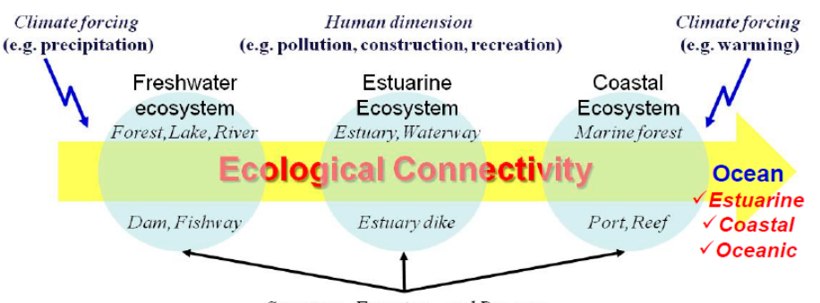
Structure, Function, and Process

Fig. 2 Example of multiple and cumulative stressors along an ecological gradient from freshwater to marine systems. From Won et al.